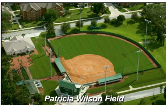
Patricia Wilson Field