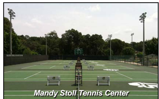
Mandy Stoll Tennis Center