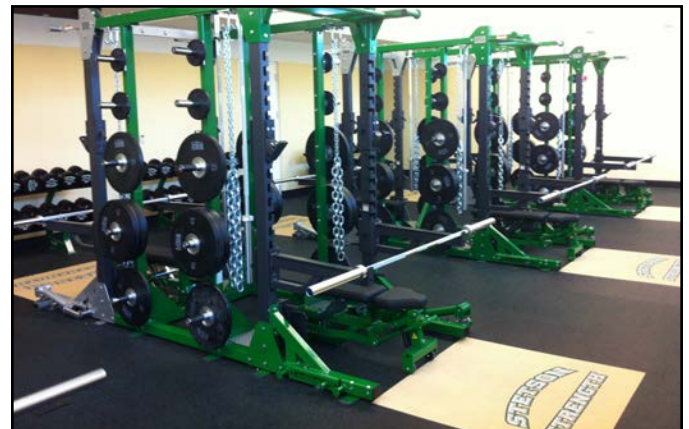
Stetson's Strength and Conditioning Facility at the Athletic Training Center