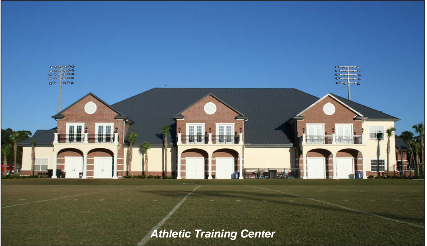
Athletic Training Center