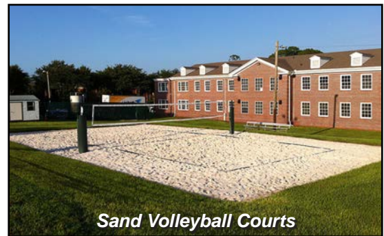
Sand Volleyball Courts